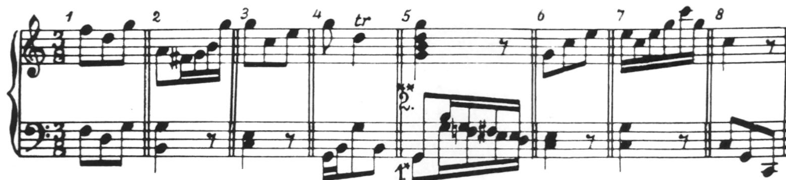
Table of Measures